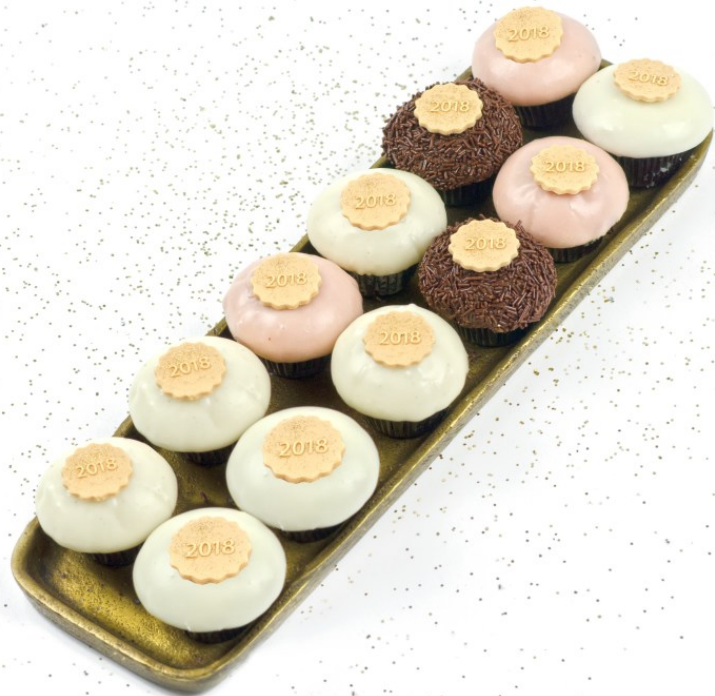
2018 MINI TOPPERS DOZEN BOX

This local favorite invites you to ring in 2018 with cupcakes crowned with exclusive, hand-cut toppers and mini cupcakes. The New Year's mini dozen box is filled with an assortment of CRAVE's best-selling mini cupcakes topped with 2018 fondant toppers for $24. This special offer is available in limited quantities in-store, or for pre-order from Friday (12/29) through Monday (1/1).