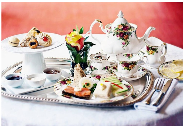
Enjoy a festive Sunday Holiday Children's Tea at Hotel Granduca.

South Elm, hit this Texas-style Weihnachtsmarkt (Christmas market) to find live music and entertainment, over 200 vendors, a wine garden and petting zoo and festive German food and drink, including brats, strudels, Christmas stollen, kanel corn, and drinks like dark Dunkles Bier and warm cups of Glühwein. Hours are Friday from 6 to 10 p.m., Saturday from 10 a.m. to 10 p.m. and Sunday from 10 a.m. to 6 p.m.