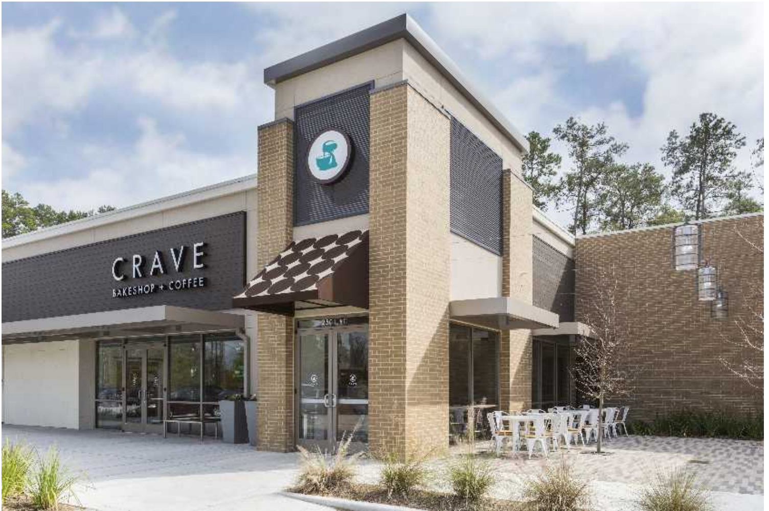
CRAVE The Woodlands