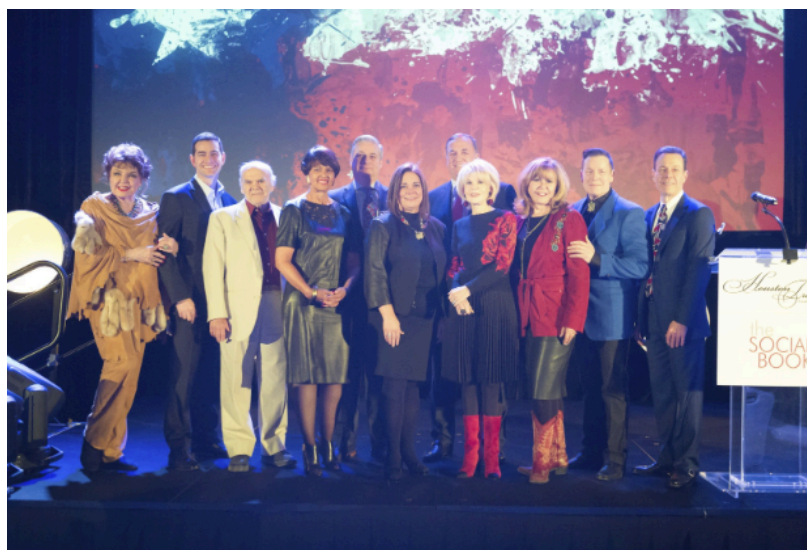
Social Book Treasures