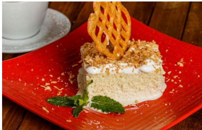
Coconut tres leches

Mezza Grille is offering a special Valentine's Day menu on Wednesday, February 14th. For $125 per couple (tax and gratuity not included), guests can enjoy a romantic celebration and choose from a select menu for a four-course meal that includes one appetizer to share, choice of soup or salad for each person, one entrée for each person, one dessert to share and the choice of one bottle of wine to share.